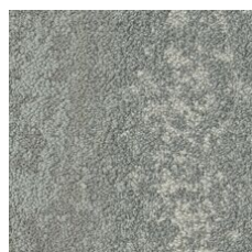
Optimistic 05105 LRV 20.9