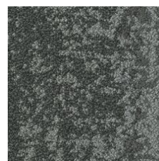
Wild 05557 LRV 11.1