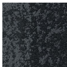
Deepest 05505 LRV 5.6