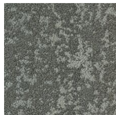
Mountain 05761 LRV 18.1