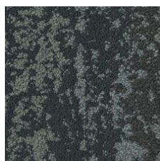
Lava 05500 LRV 6.9