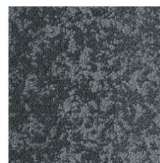
Calm 05580 LRV 9.5