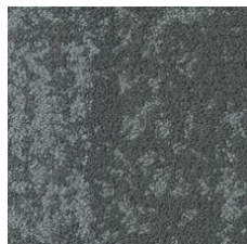
Fragile 05760 LRV 14.5