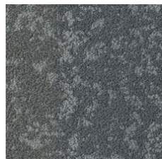
Untamed 05595 LRV 12.9